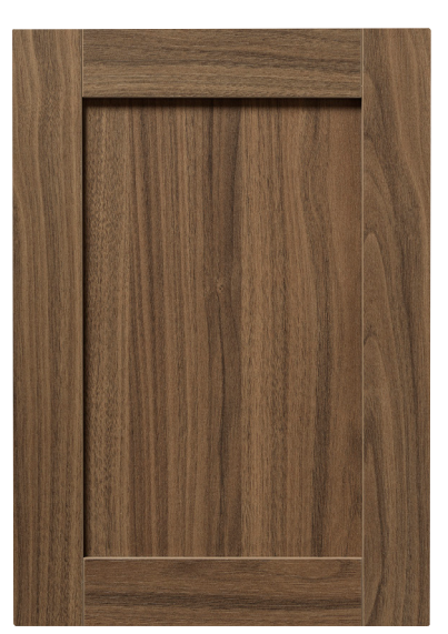
Intrigue Slim 5-Piece