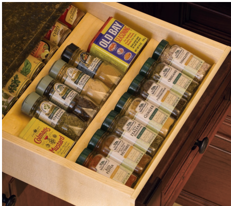
Spice tray insert