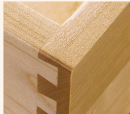
1/8" Routed edge (except outside front edge)