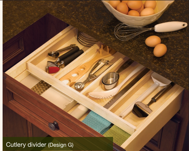
Cutlery divider (Design G)

Custom cabinetry is not only measured by quality materials and construction, but also by the organizational attributes they offer. Divide, organize and accessorize with Conestoga's comprehensive drawer box program. We offer options to maximize storage space while keeping you on schedule; shipping complete orders in 8 days or less, guaranteed.