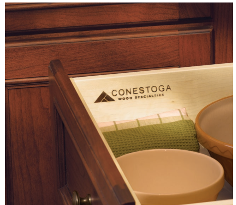
Private label logo