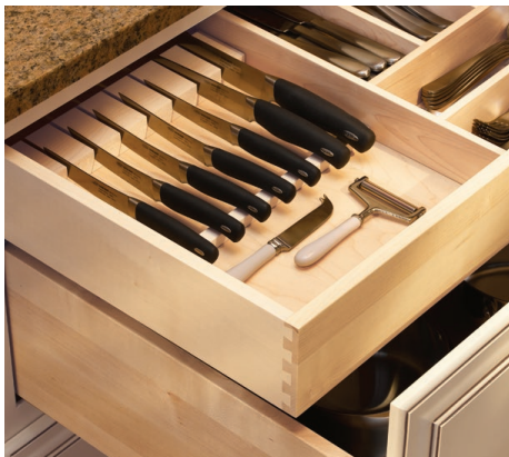
Knife block insert