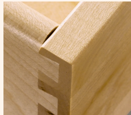
Eased edge front and back, bull-nosed sides