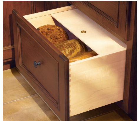
Bread box top routing